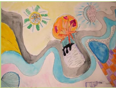
Village School 4-6 Grade Art